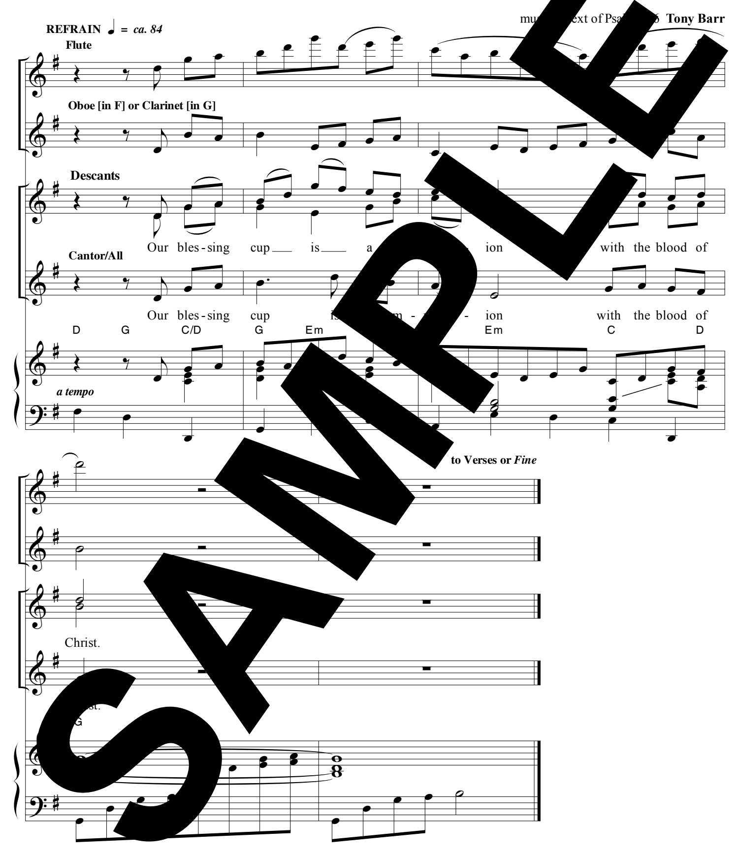
Responsorial Song from Psalm 116 for Holy Thursda