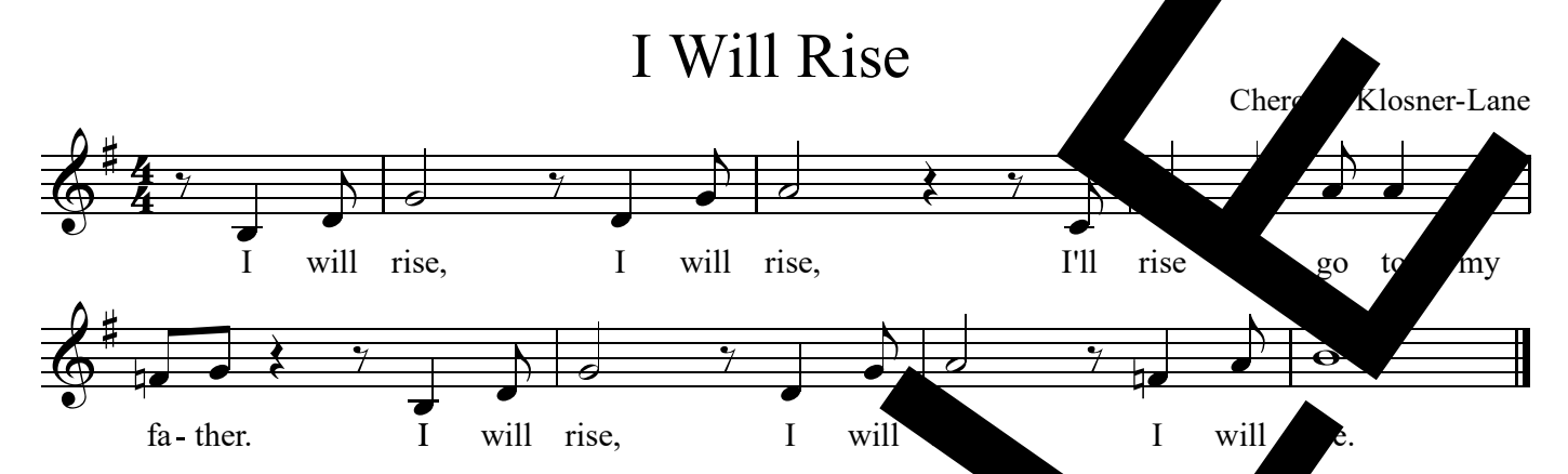
Refrain Text Copyright © 1968, 1981, 1997, International Committee on English in the Liturgy, Inc. (ICE) has reserved. Use Music Copyright © 2001 Light the Fire! Music All rights reserved www.LightTheFi