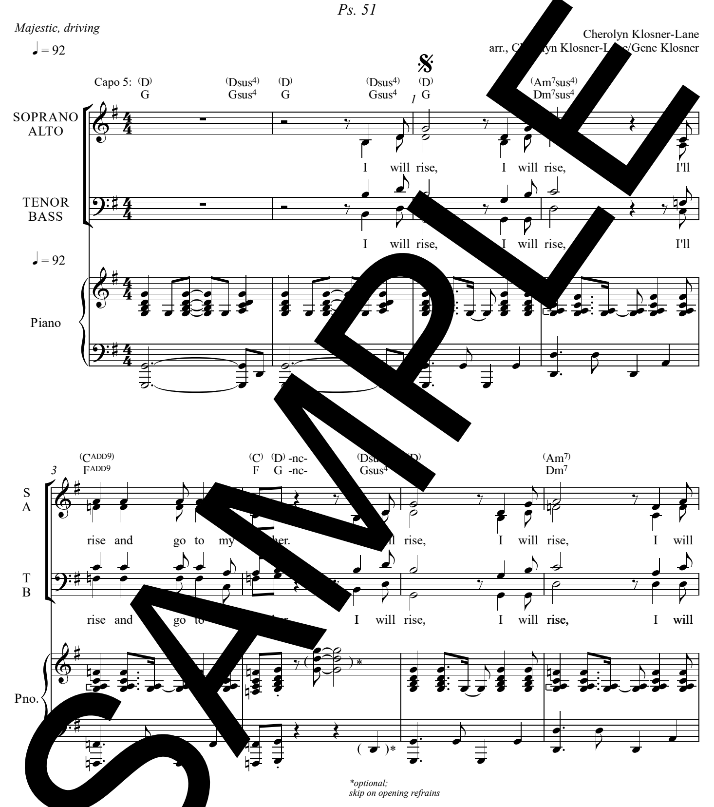
Refrain Text Copyright 5.308, 1981, 1997, International Committee on English in the Liturgy, Inc. (ICEL). All rights reserved. Used with permission. Music Copyright © 2001 Light the Fire! Music (ASCAP). All rights reserved. www.LightTheFireMusic.com