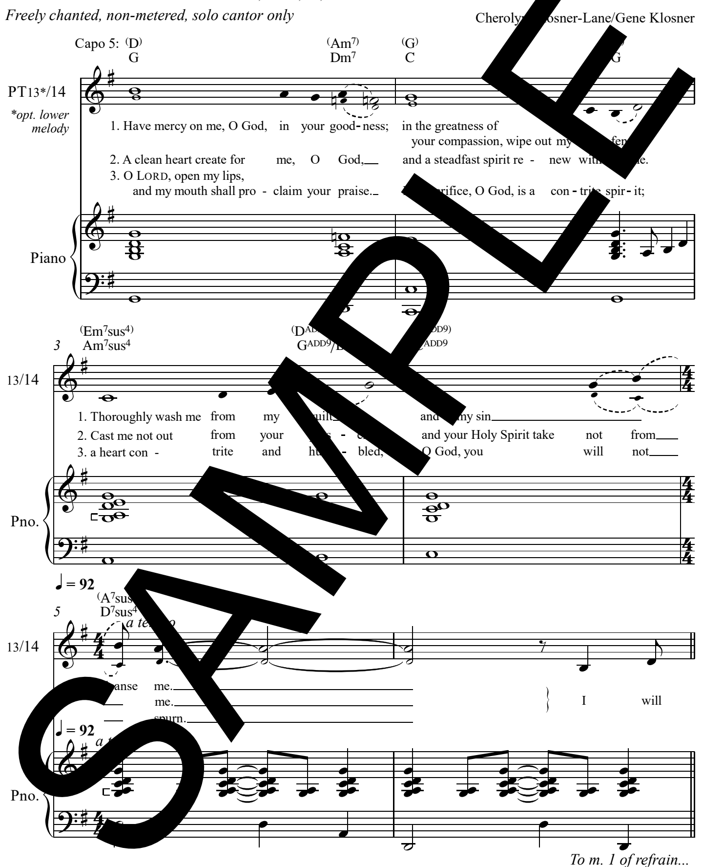
Ps. 51:3-4, 12-13, 17, 19 / Psalm Tones 13 & 14 in G