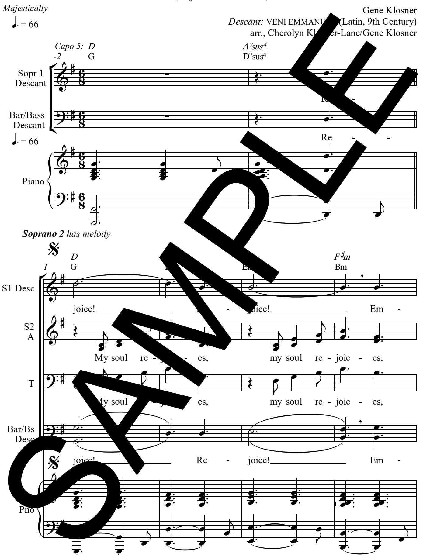
Refrain text © 1969, 1981, 1997, International Committee on English in the Liturgy, Inc. (ICEL). All rights reserved. Music Copyright © 1999 Light the Fire! Music (ASCAP). All rights reserved. Used with permission. www.LightTheFireMusic.com Report usage to CCLI/OneLicense.