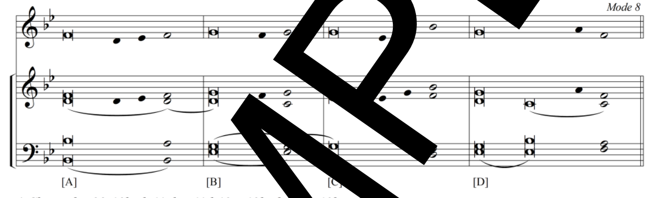
1 Chronicles 29:10bcd, 11abc, 11d-12a, 12bcd. 1