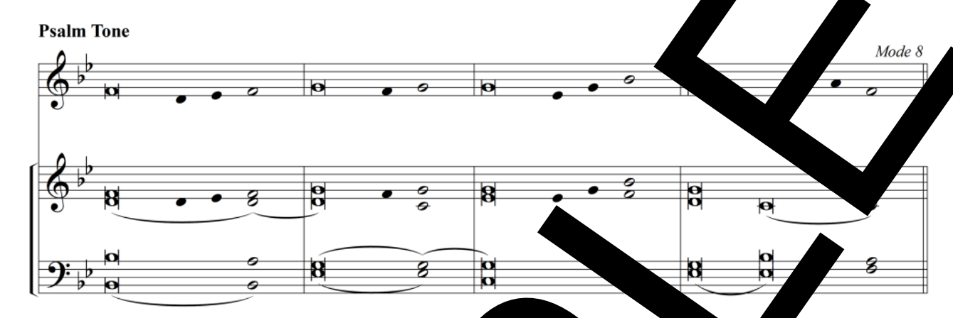
Psalm 118:1-2, 16-17, 22-23. R/v. 24