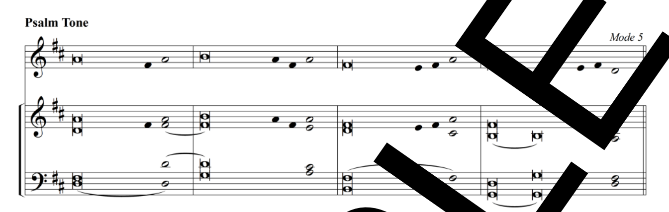
Psalm 147:12-13, 14-15, 19-20. R/v. 12; Jn 1:14