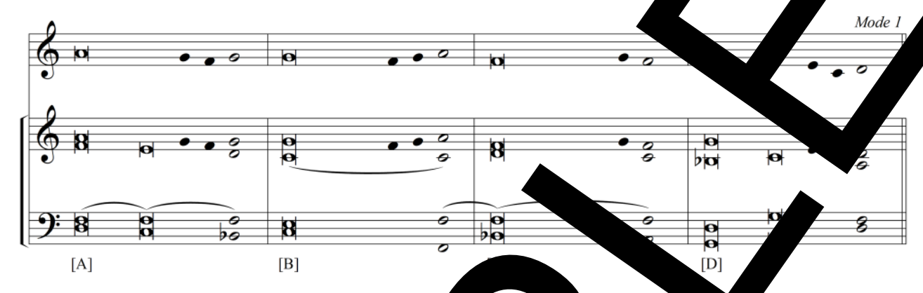
Psalm 16:5, 8, 9-10, 11. R/v. 1