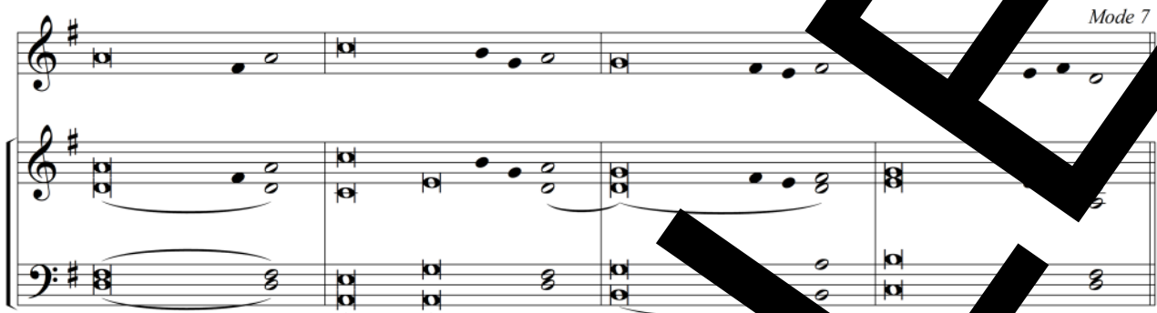
Psalm 27:1, 7-8, 8-9, 13-14. R/v. 1a; 13

The LORD is my light and my <u>sal</u>vation; whom <u>should</u> I fear? The LORD is <u>my</u> life's refuge; of whom should I be afraid? R/