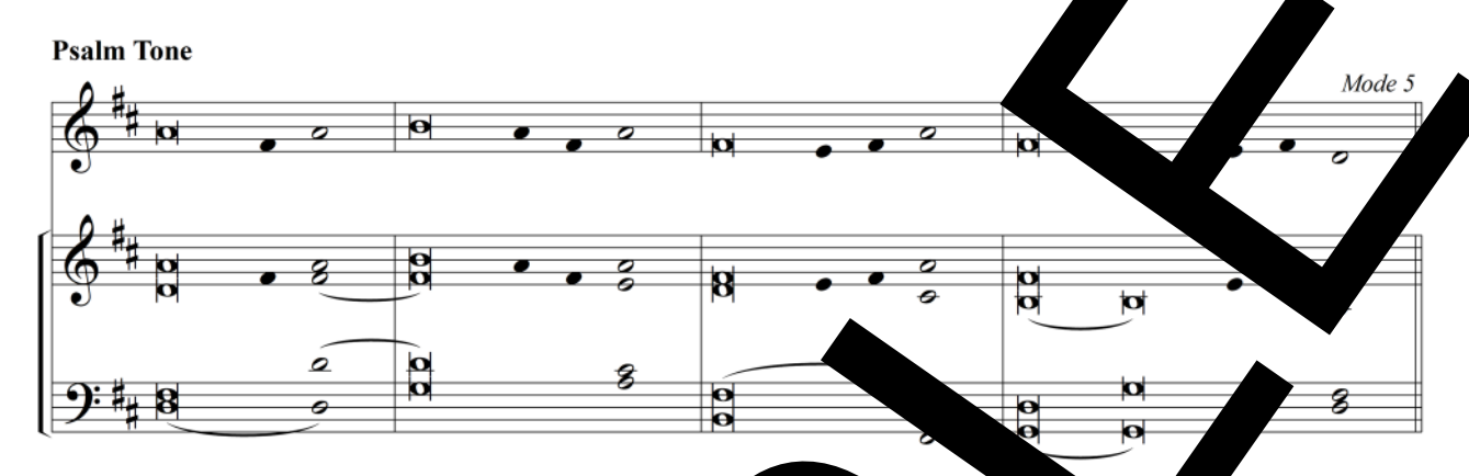
Psalm 66:1-3, 4-5, 6-7, 16, 20. R/v. 1