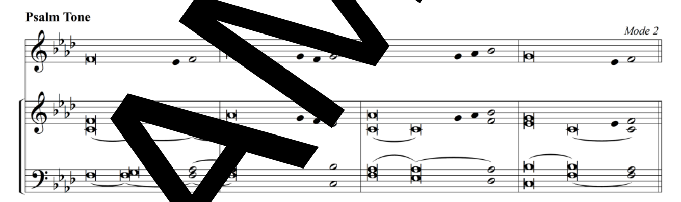
salm 85:9-10, 11-12, 13-14. R/v. 8

will hear what God <u>pro</u>claims; the LORD—for he proclaims peace <u>to</u> his people. Near indeed is his salvation to <u>those</u> who fear him, glory dwelling in our land. R /