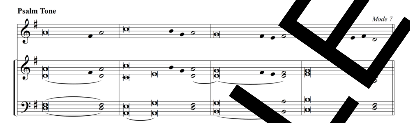
28 OT B Psalm 90:12-13, 14-15, 16-17. R/v. 14