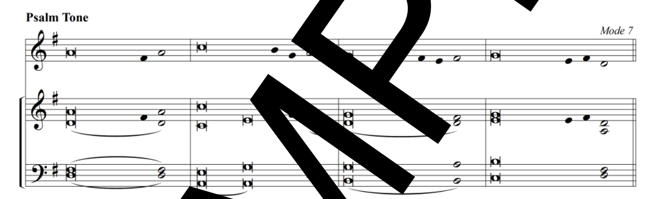
Psalm 95:1-2, 6-7, 8-9. R/v.