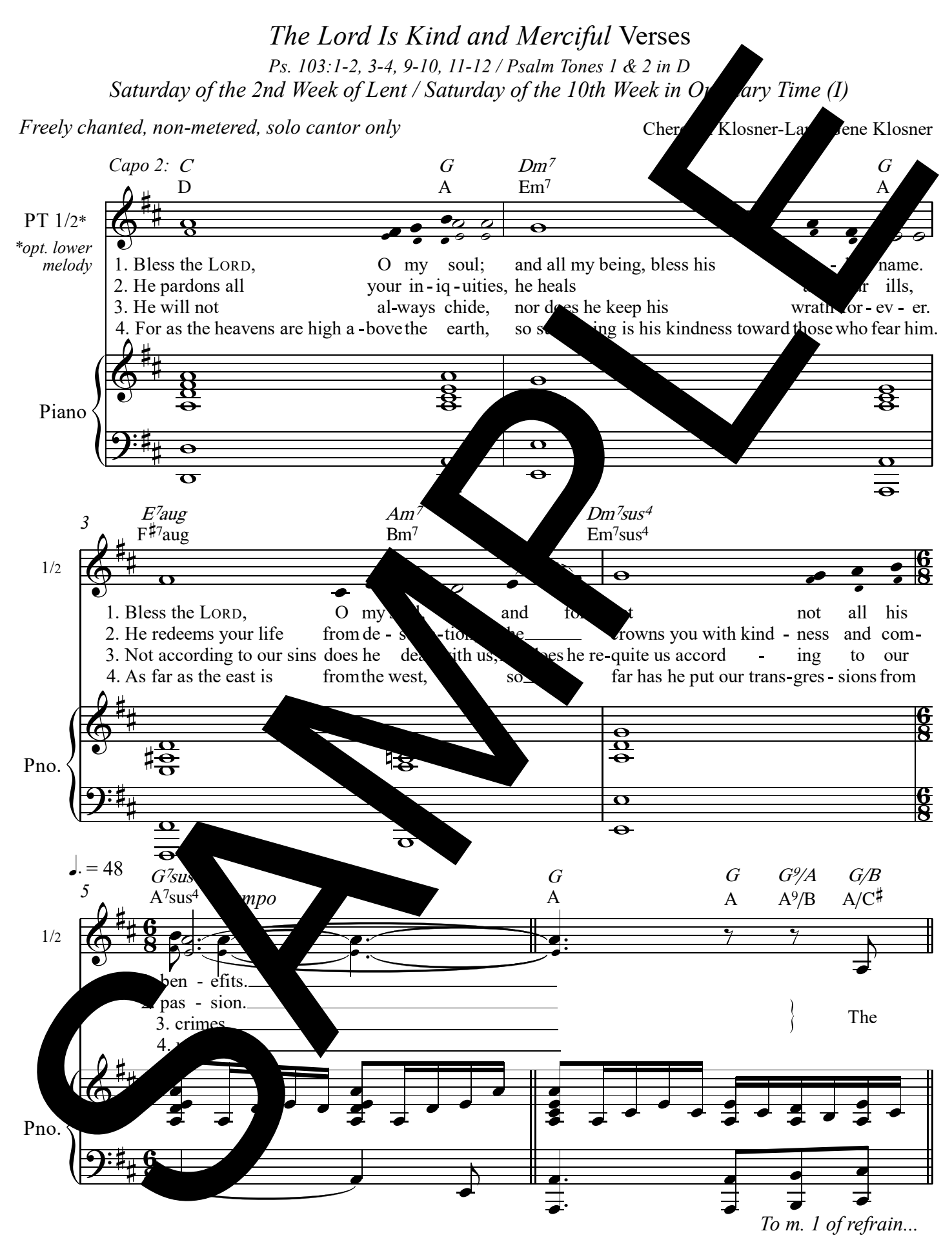
Verses Text Copyright © 1970, 1986, 1997, 1998, 2001 Confraternity of Christian Doctrine, Inc. (CCD). All rights reserved. Used with permission. Music Copyright © 1998 Light the Fire! Music (ASCAP). All rights reserved. Report Refrain usage to CCLI/OneLicense.