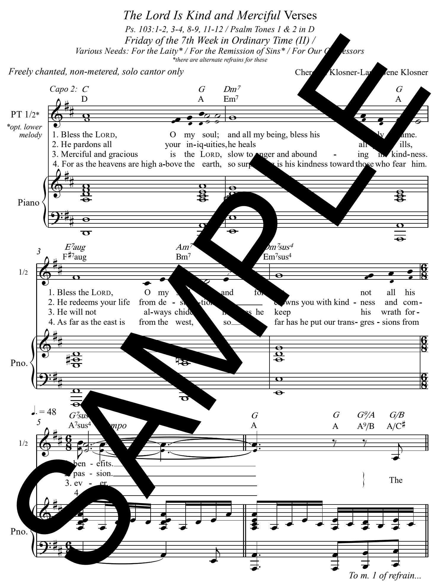
Verses Text Copyright © 1970, 1986, 1997, 1998, 2001 Confraternity of Christian Doctrine, Inc. (CCD). All rights reserved. Used with permission. Music Copyright © 1998 Light the Fire! Music (ASCAP). All rights reserved. Report Refrain usage to CCLI/OneLicense.